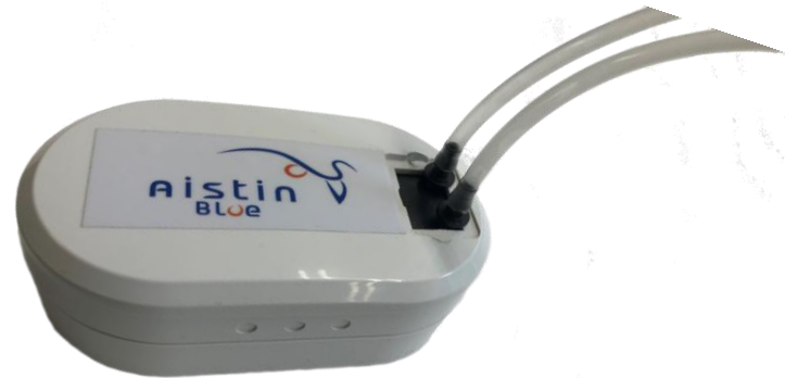
Aistin IoT Device is available with IP65 (picture above) is with plastic covers.

Server independent customizable Docker based modular Aistin Cloud Solution allows users to easily monitor and manage IoT devices via internet.